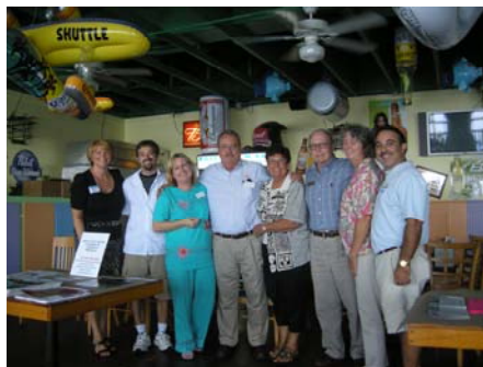
New members at the Leadership Luncheon